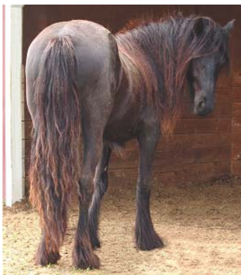
Lunesdale Rock Rose (aka "Roxy") looks like quite the 'glamour girl' with all that hair, but looks are deceiving and she was still very much a baby at only 2 years old. At this stage she was too young for breeding or serious training, and lived out with our herd.

autumn market in northern England for livestock and other merchandise, and especially for Fell ponies. The unbroken stags would be sold to tradesman, dealers, and other sorts to be trained for work under saddle, to pull light carts, for packwork, or trained to gears for use in the local mines. Although the Brough Hill Fair no longer serves this purpose, the tradition of raising Fell ponies in this manner continues, and there are still markets and fairs in which unbroken Fell ponies are sold. And while the numbers of semi-feral herds continues to dwindle, young Fell ponies raised on the fells today still may enjoy unbridled freedom (literally!) just as Nature intended, until age 3 or 4 when they are bred and/or started in training. If the training is started at age 3, it typically consists of only a short period of light training to start the pony under saddle or in harness. Not uncommonly, after this the pony is turned back out with the herd until the following year, to give it another year to mature.